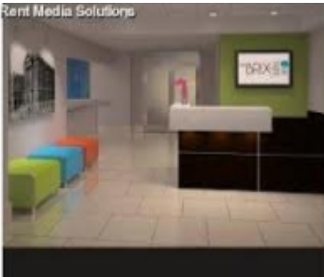
For Rent Media Solutions

Live large in this small community. Your apartment features a stylish open plan with aesthetic finishes in a hip neutral palette. Just steps from all of the fun of the southside.