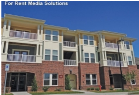
For Rent Media Solutions

Introducing Creekstone at RTP - A brand-new apartment home community in a prime, central location within one of the country's fastest growing metropolitan areas, Research Triangle Park. Now you can be among the select few to have your choice of pristine 1-, 2- and 3-bedroom garden style floor plans. Our outstanding features and amenities include; granite countertops in all kitchens, included washers and dryers, detached garages, elevators in certain buildings, a fitness club, and a cyber café with WiFi. Located only five minutes from RDU international airport and Southpoint Mall featuring fine dining and shopping, everything about Creekstone at RTP is dedicated to your convenience.